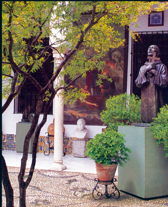
COURTYARD OF THE MUSEUM

In the whole set of works it is necessary to emphasize the collection of Jesus children, the flamenco paintings and the pieces made in ivory, together with exotic objects proceeding from the missionary tradition of the Order in Africa and America.