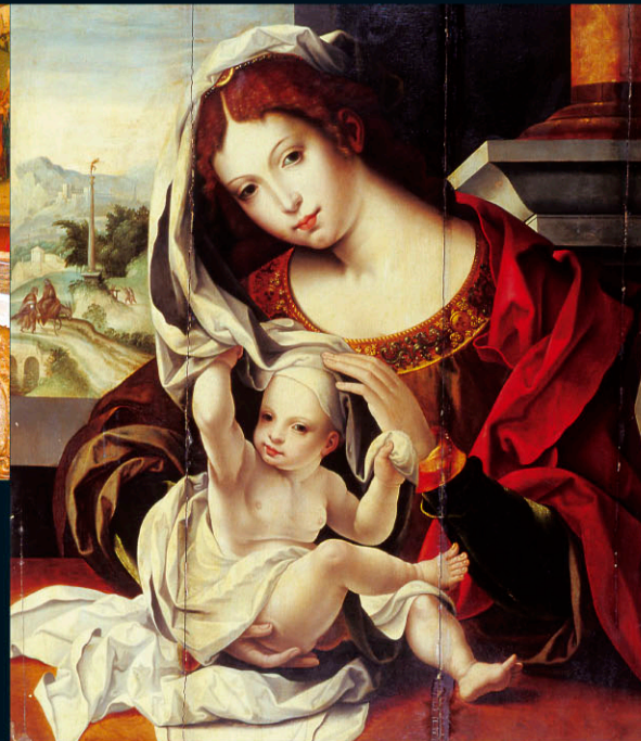
RIGHT > FUNERAL URN FROM CHIMU CULTURE, 5 TH CENTURY. LEFT > VIRGIN OF THE DIAPERS

Saint John of God's personal objects, kept in sumptuous reliquaries, deserve a special mention: the cane and the beggar basket, together with one of the crucifixes that accompanied him during his life dedicated to the needy ones.