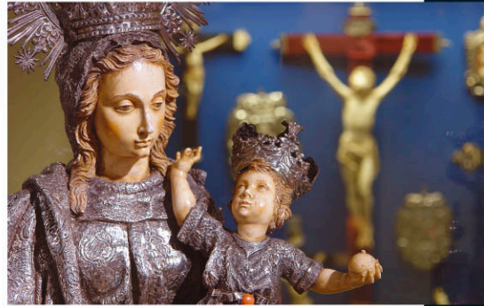
THE COLUMNIS ROOM

Simultaneously to the abundant iconography of Saint John of God, a great amount of paintings, engravings, gold articles, ivories, furniture, porcelains... is exhibited, making it be considered as the most important museum of his kind in the whole Andalusia.